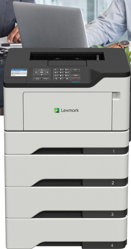
M1246 with optional trays