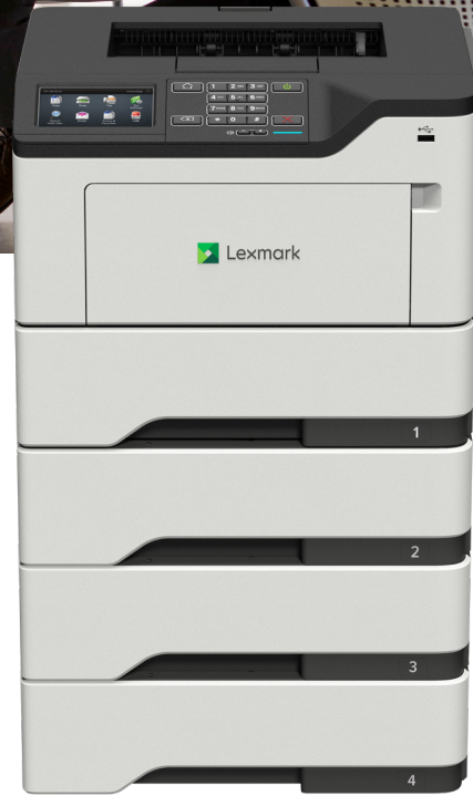
M3250 with optional trays