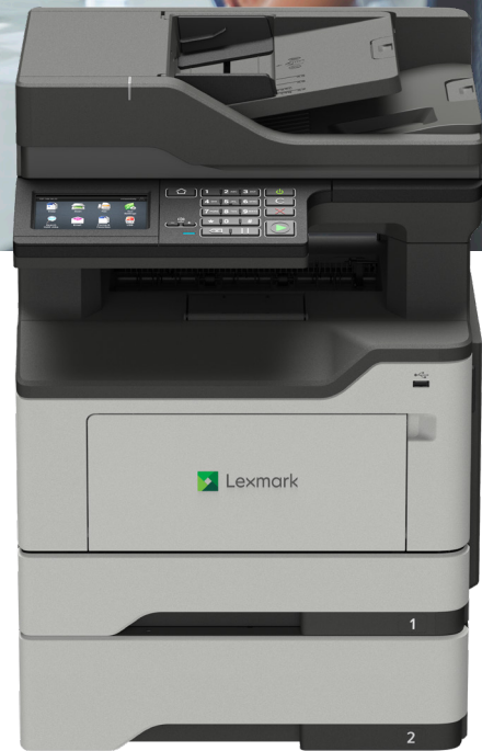
XM1242 with optional tray